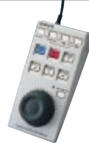
DSRM-20 Remote Control Unit