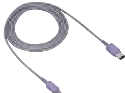
VMC-IL4615/4635 i.LINK Cable (4-pin to 6-pin)