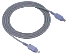
VMC-IL4408/4415/4435 i.LINK Cable (4-pin to 4-pin)